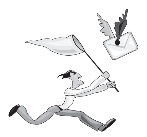
Don't forget to let us know...